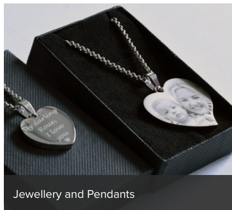
Jewellery and Pendants